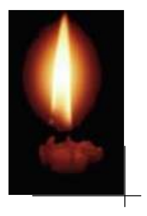
Enlightenment is a state of mind that keep flowing and uniting as well